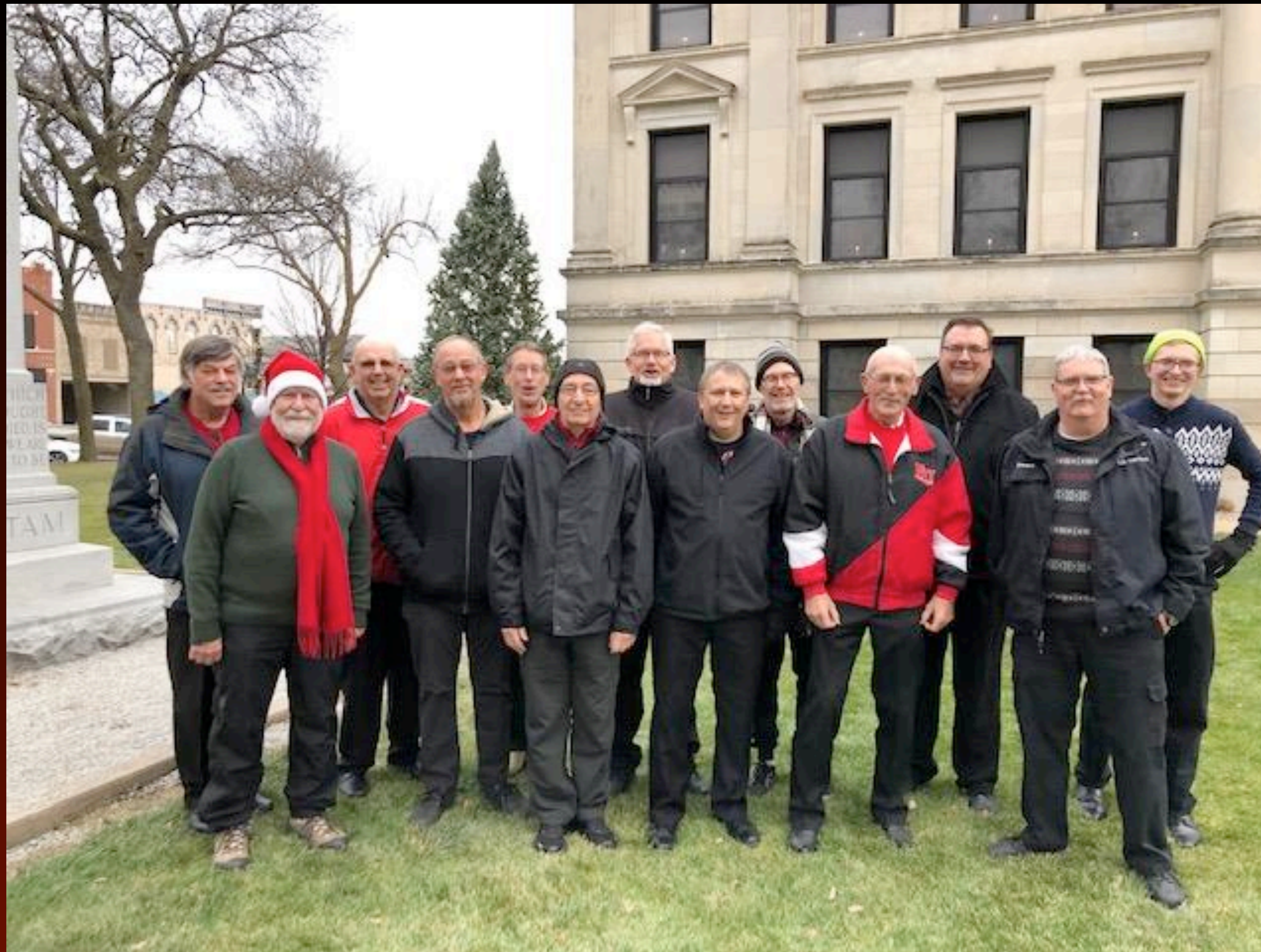
Christmas Caroling 2018 Seward, NE