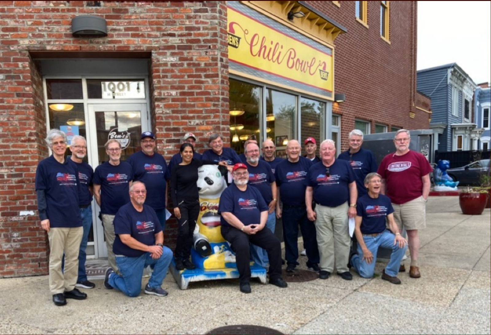
Washington, D.C. 2022