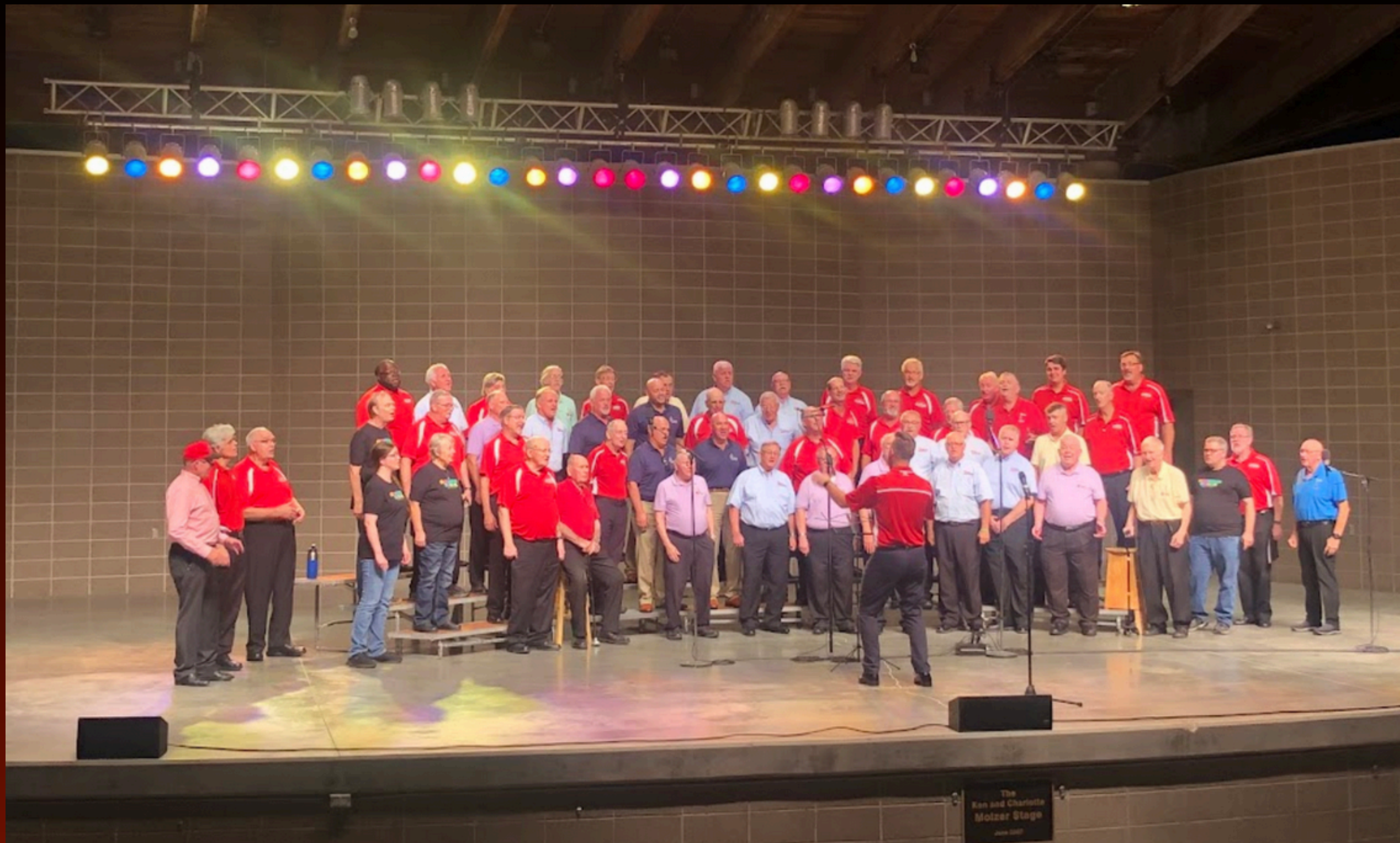
Sarpy Seranade's Sing Out in Omaha August 2022