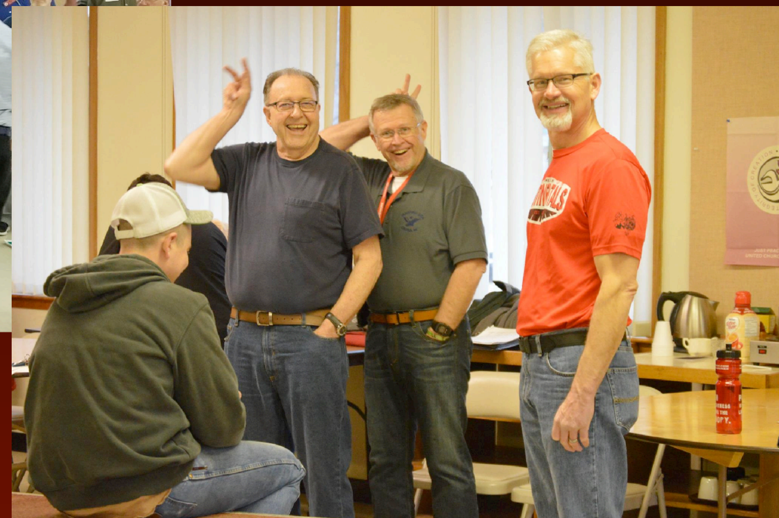
Tuesday Night Rehearsals