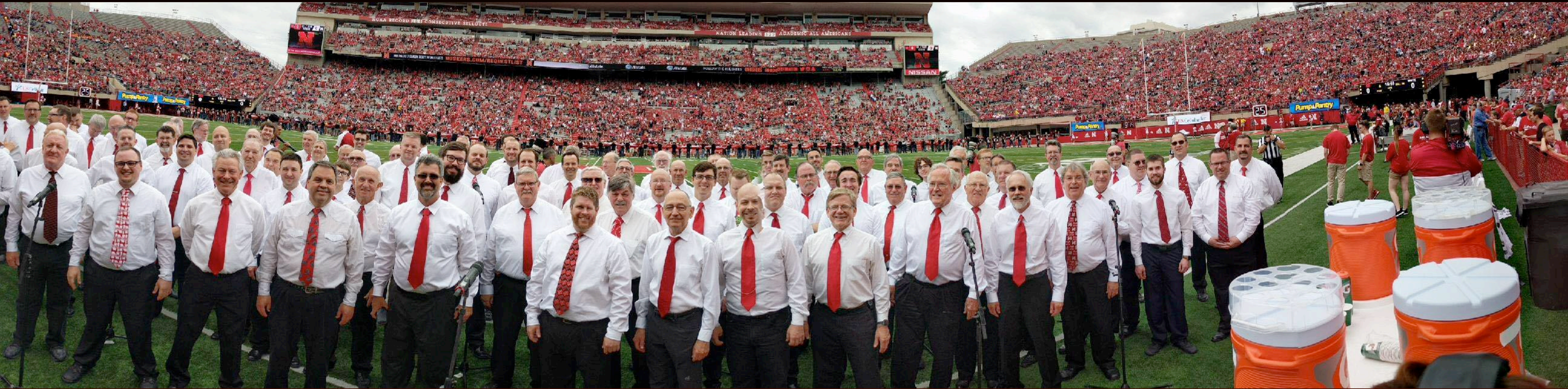
National Anthem at 2019 Cornhusker Spring Football Game