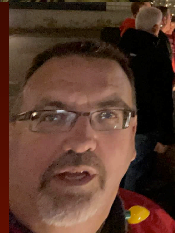
Christmas Caroling 2021