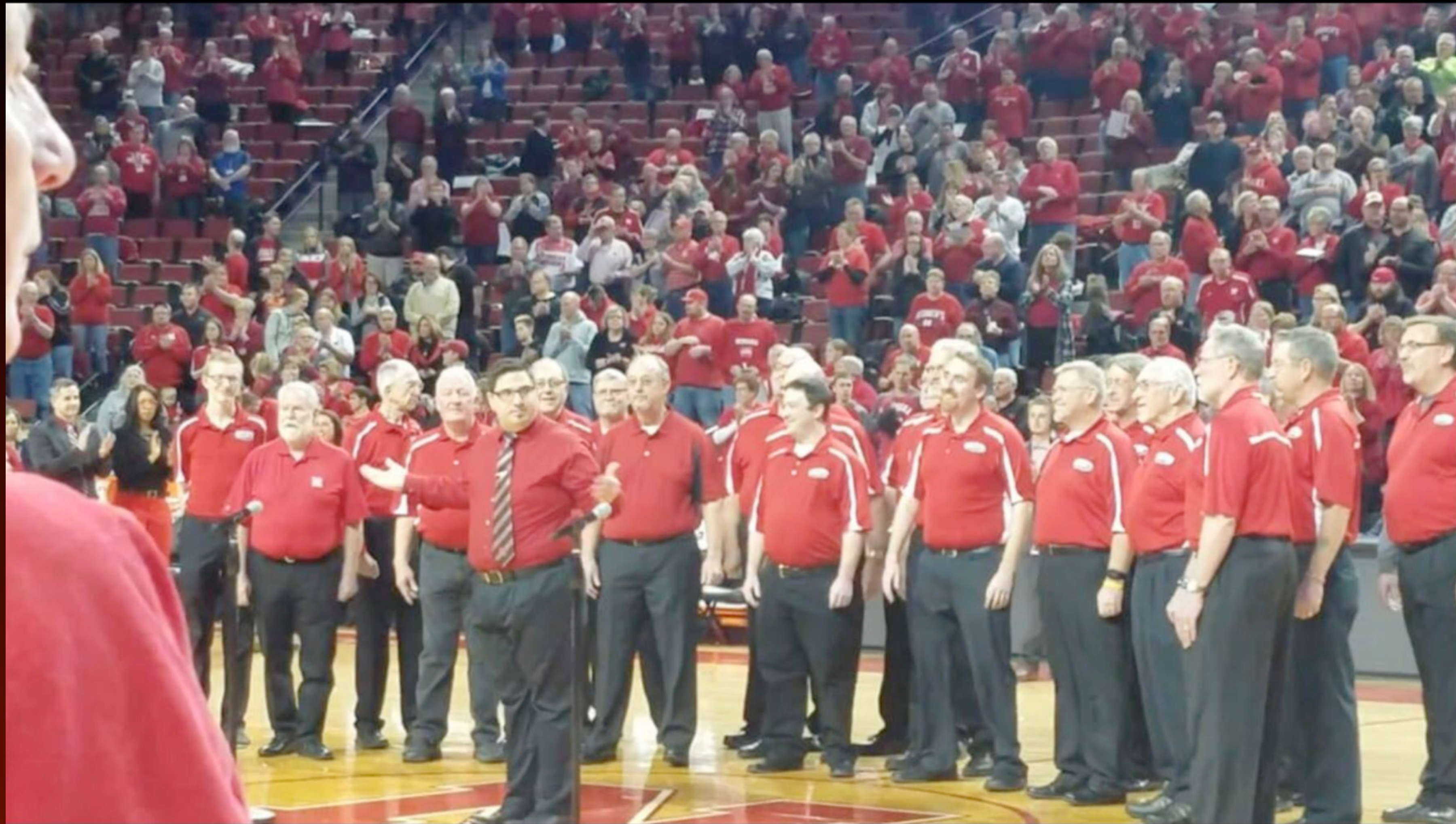
National Anthem at Cornhusker Women's Basketball Game