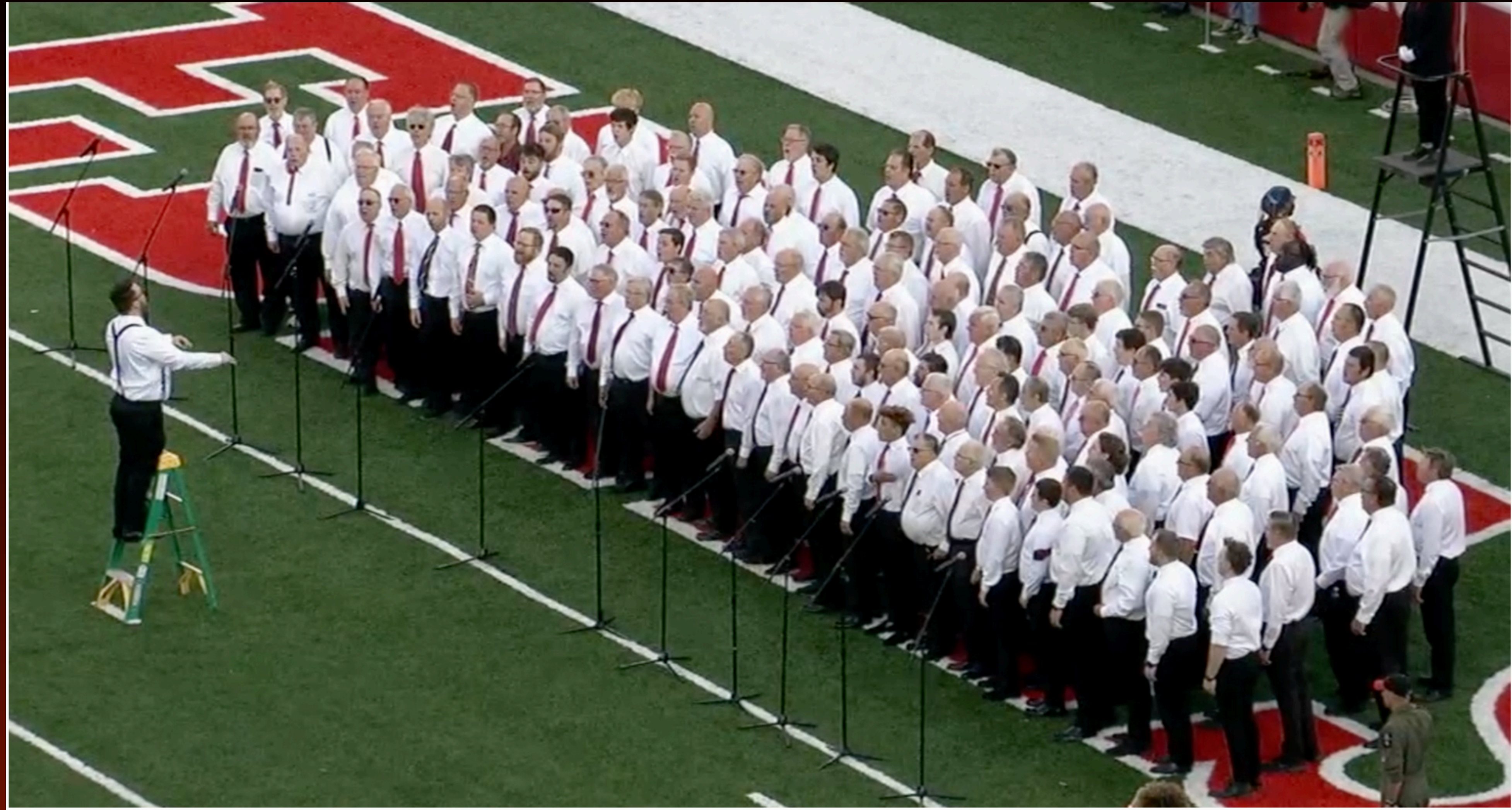
National Anthem 9/10/2022 Cornhuskers v. Georgia Southern Football Game