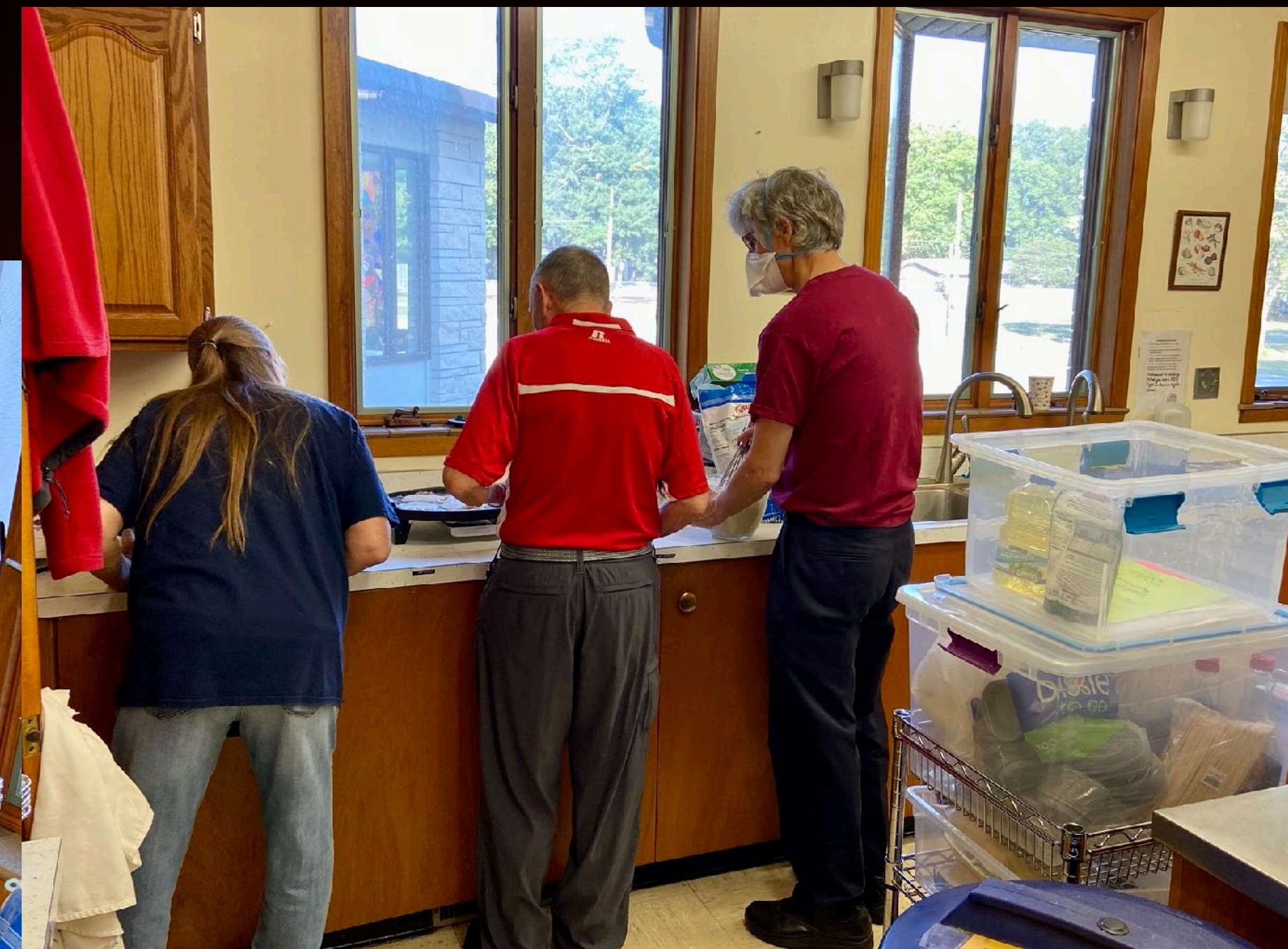
Community Service Northeast United Church of Christ Pancake Breakfast 10/1/2022