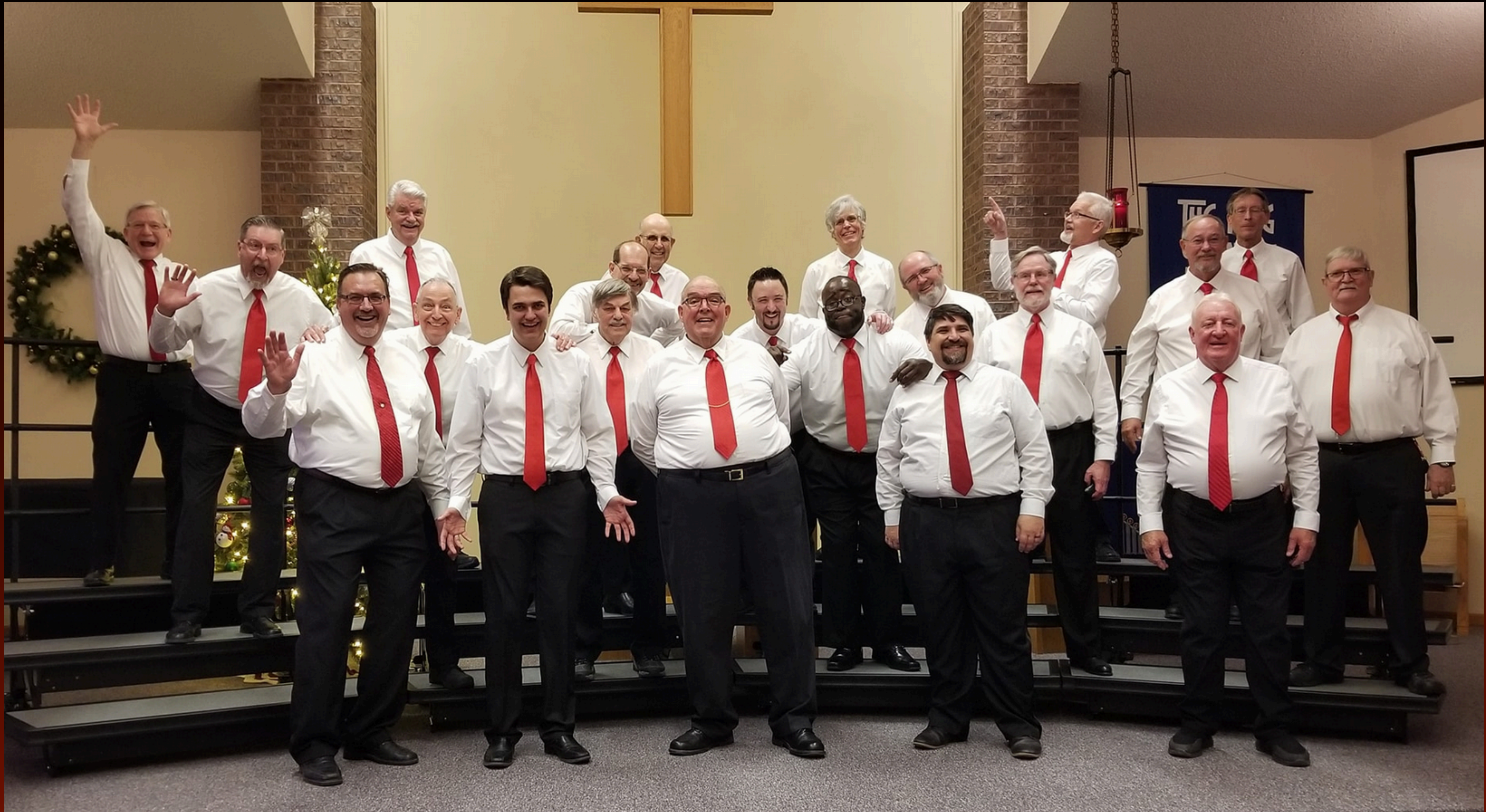
Christmas Show 2021